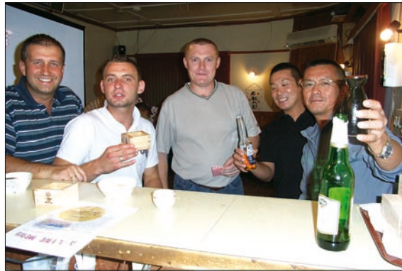
Grand Opening Party of 'A-Line' Mess

We also serve drinks at low prices. For example, you can drink vodka and rum freely at all times.