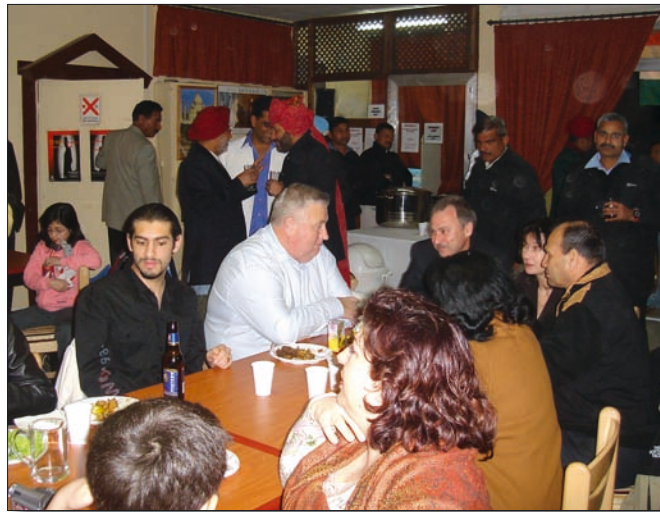
Party in progress

pated in another eagerly anticipated event – the lucky draw of the raffle tickets that they had purchased earlier. After all there were so many interesting & expensive prizes for