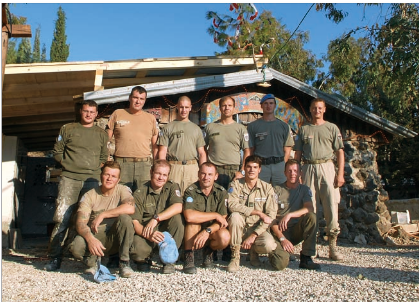
The fine, good-looking and hard-working construction team!

The rareness of the favorite honky-tonk 'Schweija Hut', is not only its unique atmosphere, which is met day in – day out, but also the fact, that it was the first welfare-facility at UNDOF, welcoming all contingents and all ranks.