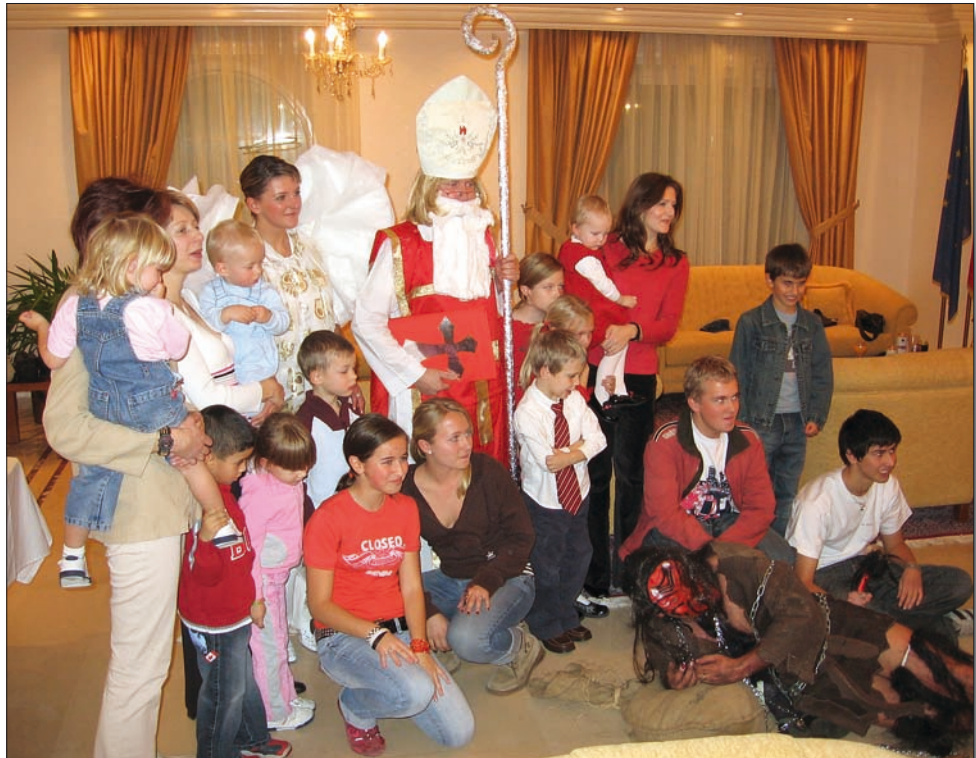
Santa Claus and happy children