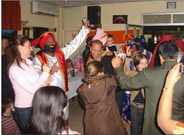
Guests trying a foot on Bhangra

The choice of venue was significant since no such function had been organized in Damascus by the Indian contingent; and the OGG contributed in a large way to the arranging this event by permitting utilization of Ismac House for the same.