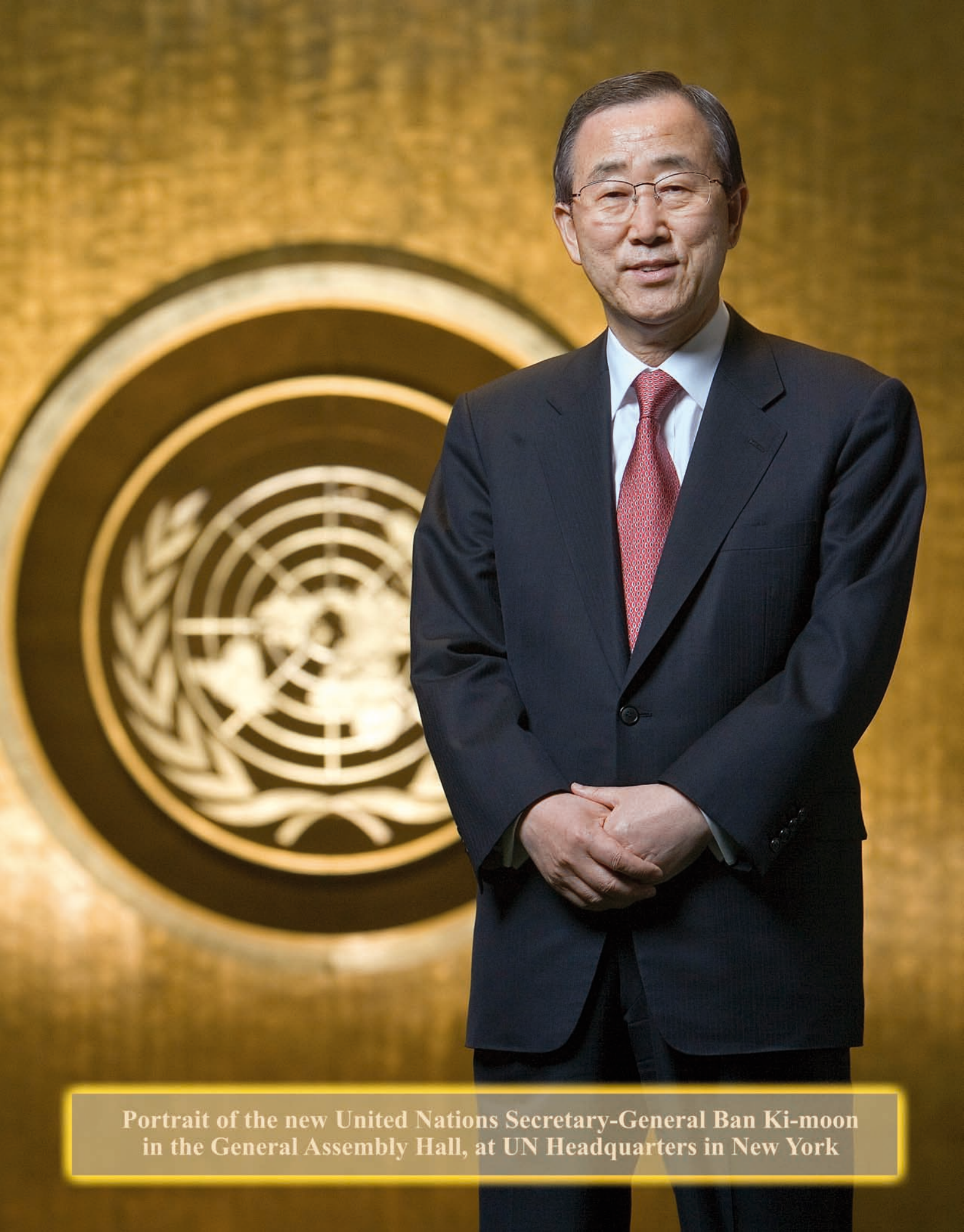
Portrait of the new United Nations Secretary-General Ban Ki-moon in the General Assembly Hall, at UN Headquarters in New York