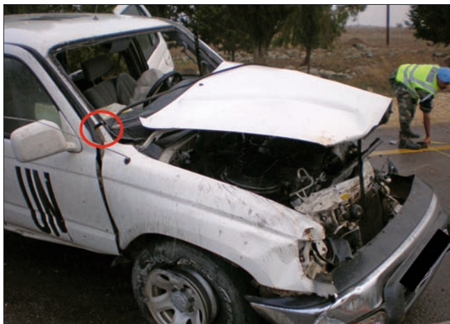
WO III Singh, B-Det Cmdr, marking an accident scene

extremely careful when driving on a wet road! Dirt has been accumulating for many months, and together