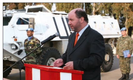
Polish Ambassador addressing the audience