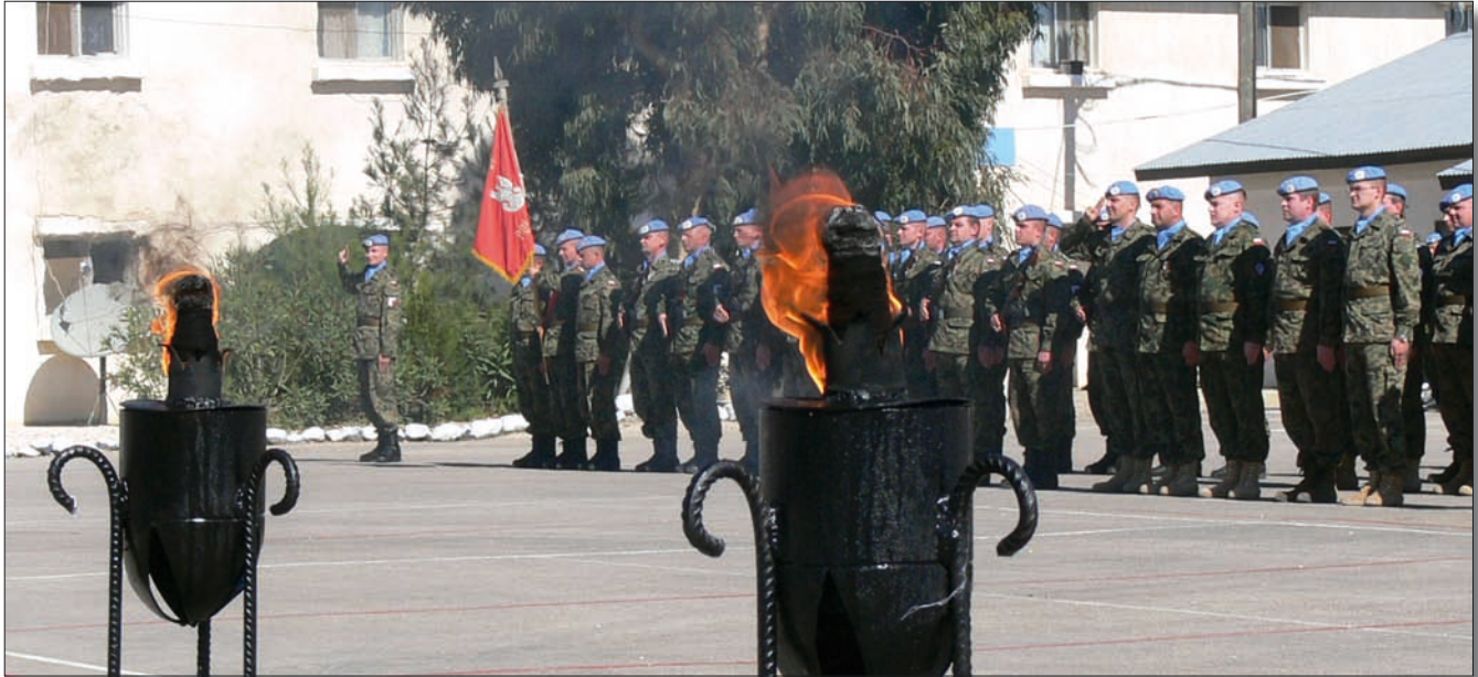
Appeal of Heroes of War for Polish Independence

The Day of Independence is an extraordinary event. For Polish – especially for soldiers, outside borders of their homeland.