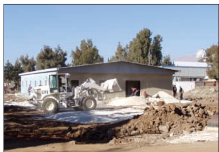
J-Con Heavy Equipment levelling the area around the new Medical Center