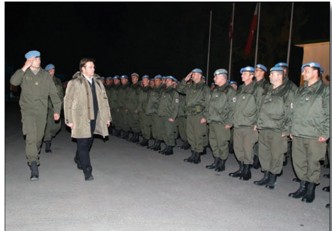
Visit of Mr. Günther Platter, Austria Minister of Defense. The Minister talked with the FC in ROD, visited CF and dined with AUSBATT members at AIK. (15 th -17 th Nov 2006)