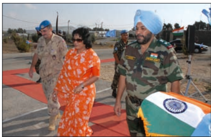
UNDOF's 'First Lady' with CO LOGBATT