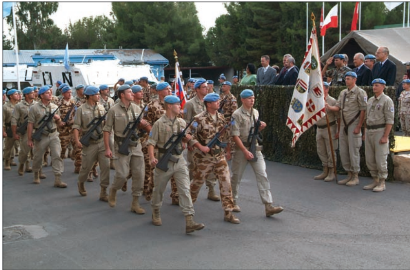
Final march of soldiers alongside Guests of Honor