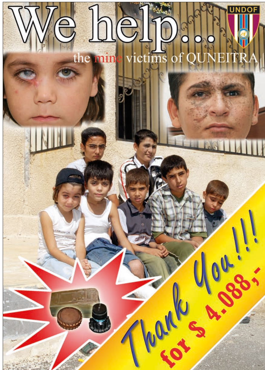
Poster for the Fundraising Campaign within UNDOF

Where there are wars, there are also always mine victims. Once a war is over, hence the slaughtering of people, there is still an eminent threat from mines. Even on the Golan Heights, 33 years (!) after the cease-fire agreement, mine danger still exists.