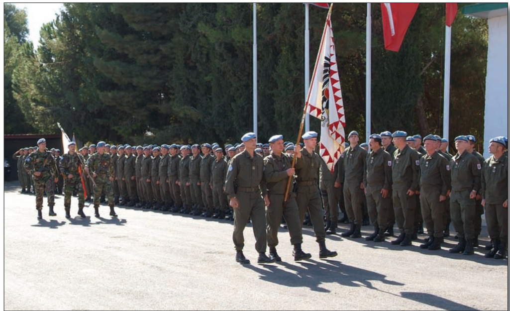
Flagbearers marching alongside mustered soldiers