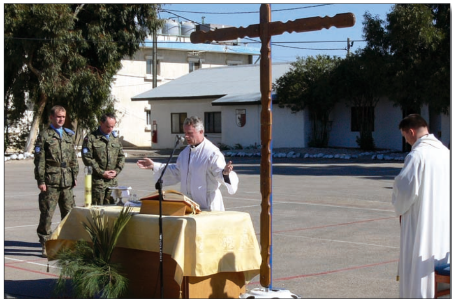
Holy Mass at Camp Ziouani