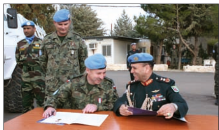
OIC and FC signing the HTO-Protocol