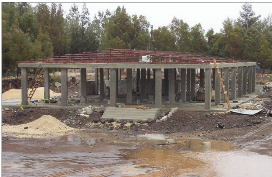
Skeleton structure with ceiling and truss

The introductory article to the Medical Center Story, in Golan Journal 108, described the initiation of the project while the current article will tell you more about the phases of construction.