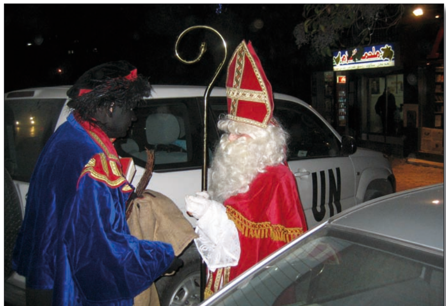
St. Nicolaas and Black Peter discussing 'plan of action'