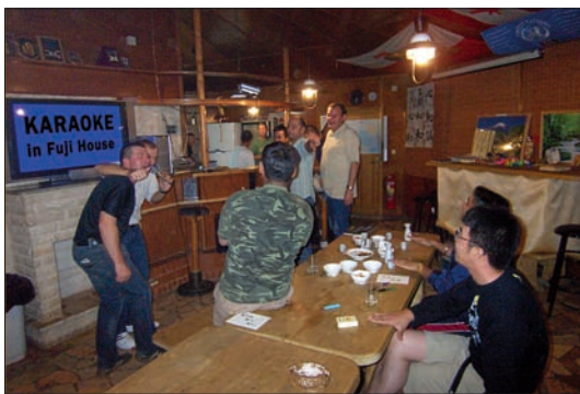
Karaoke-Time in 'Fuji House'

Fuji House is the Japanese bar located near 'Pentagon' in Camp Faouar. This bar was previously owned by the Canadian Contingent and passed on to J-CON. 'Fuji' is the name of a mountain. It's the highest, most famous and beautiful mountain in Japan.