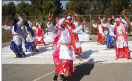
Celebrations with Bhangra

In India Diwali is celebrated with the lighting of traditional lamps and candles, people clean and decorate their homes, wear new clothes and hold joint family prayers in the evening. This is followed by bursting of fire crackers, partaking of sweets and feasting by the whole community. Businesses give bonuses to their employees and in the country side, the farmers save throughout the year to purchase new clothes, household articles for their family and homes. Diwali is a closed holiday in India and is in fact the start of a new year as per the Hindu calendar. On an almost perfect, bright and pleasant autumn day on 21 st Oct 2006, the Indian contingent celebrated Diwali in Camp Ziouani - the very first time this had been done in the Golan Heights. The