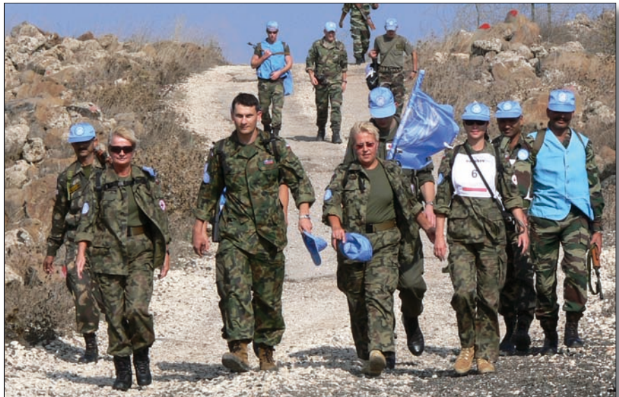
Faces of tired but happy participants